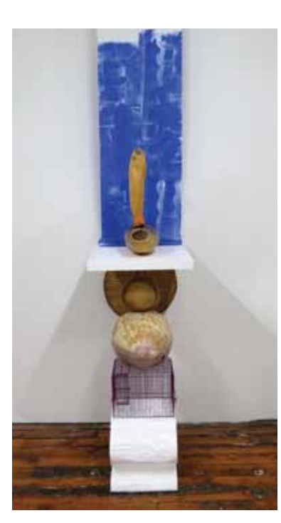
Robert Rhee Second Bird of Passage, 2012

Rhee's Wind Egg gourd sculptures are evocative of ancient ritual and common use. Some are embellished with jewels, sport light bulbs, or are adorned with rich painterly swashes of color. Like a steampunk Brancusi, the work is at once familiar and alien. Rhee's practice deploys formal historic motifs of sculpture, such as the totemic forms of Second Bird of Passage , and the Arp-like forms of the Wind Eggs . They simultaneously engage in deliberately impermanent materials, such as the gourds themselves, that relate to folk and craft applications.