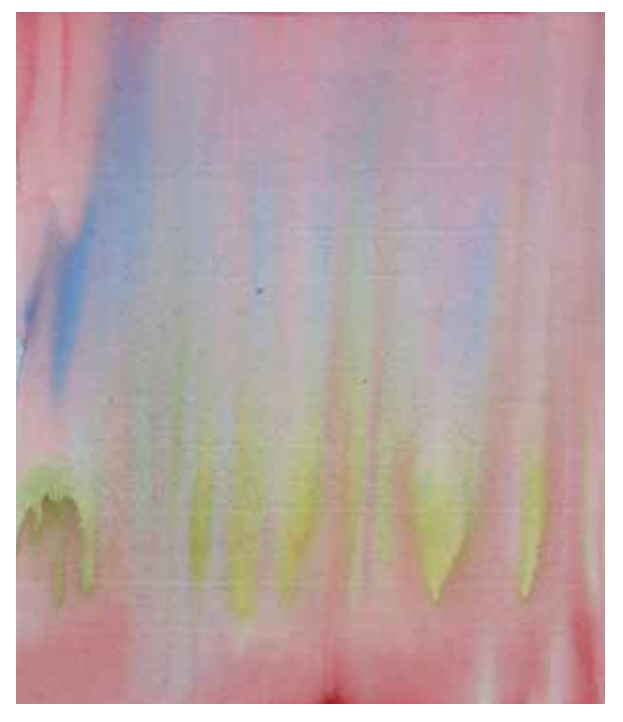
Stephen Truax I never knew a man could tell so many lies (detail), 2012

ing, and sum up to create an "obstruction" within the space of the gallery. It is as if what was once a demure object on a pedestal blocking a path towards a painting is now a linebacker holding ground for sculpture.