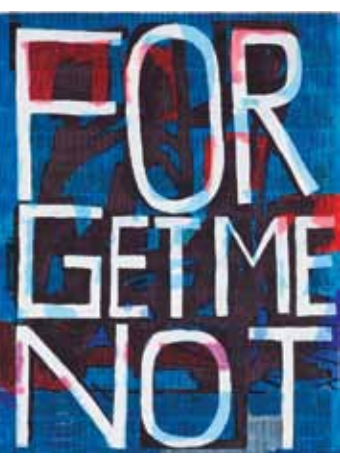
EJ Hauser forgetmenot, 2012

EJ Hauser's painting practice is deliberately mul-