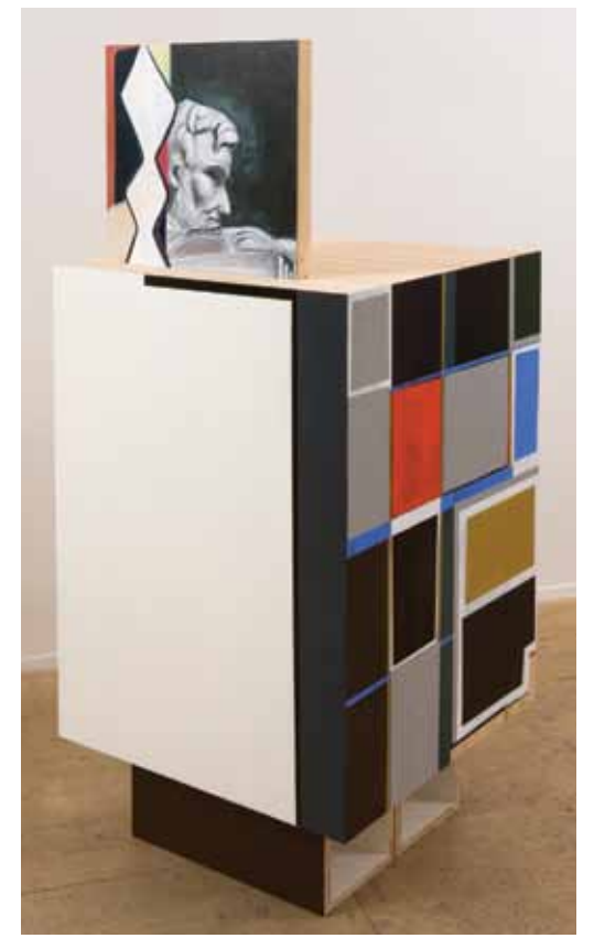
Pam Lins Lincoln Bookend Obstruction, 2010

Eating these delights in a local coffee shop, we (the curators) came to realize that our conversations about art and these hybrid pastries were related. Planning Donut Muffin , we had conversations with artists approaching painting from a sculptural perspective. We discussed sculpture as drawing, and light as painting. We came to realize that in contrast to the orthodoxy of Modernist and subsequent postmodern practices, these artists embrace porous and iterative approaches to art-making, and in so doing, acknowledge the ever-shifting experience of the viewer. We saw the studio and talismans of everyday life folded into formal practices of painting and sculpture. Hierarchies of art objecthood and materiality were being challenged. Above all, we found the