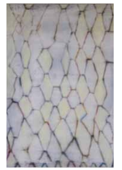
Clinton King Confetti you make me cry, 2012

tifaceted, an aggregate of multiple threads and conversations. Discrete bodies of work coalesce to form a larger project. Subsets include textbased works, figurative painting, abstract painting, and conceptual approaches to color. Similar to King's initial "parameters," Hauser approaches paintings by first establishing an armature, and then building up and out from this initial structure. These early forms diverge and challenge singular readings of painting, canonical notions of "signature" practices, and gender identity as it relates to painting and art-making.