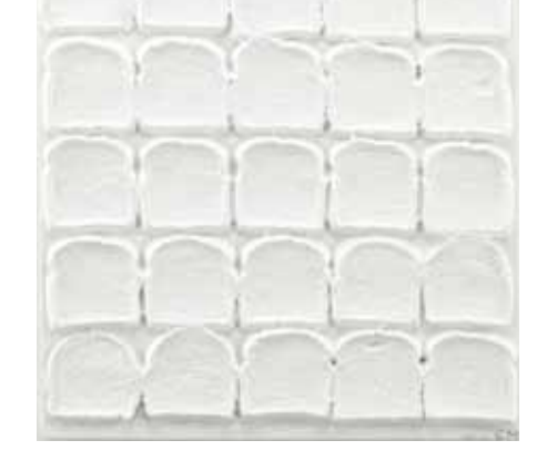
Chris Martin Bread Painting, 2012