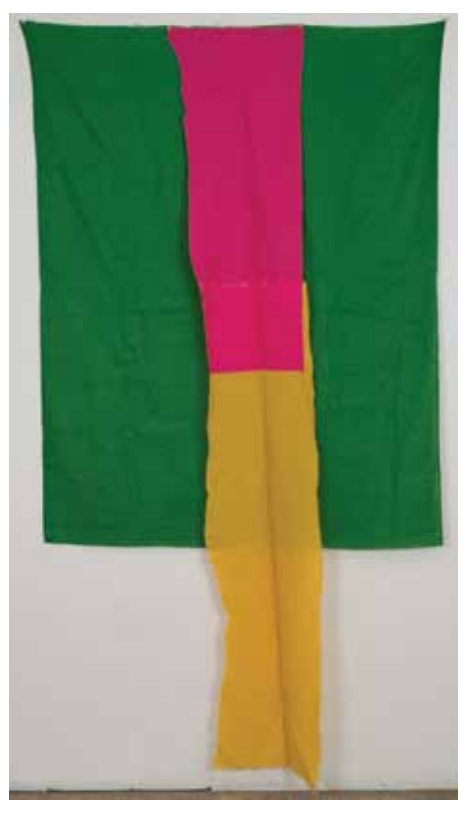
Joe Fyfe TALAT SAO, 2011