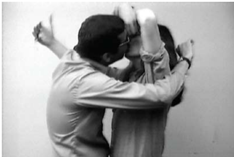
Allan Kaprow Time Pieces, 1975.