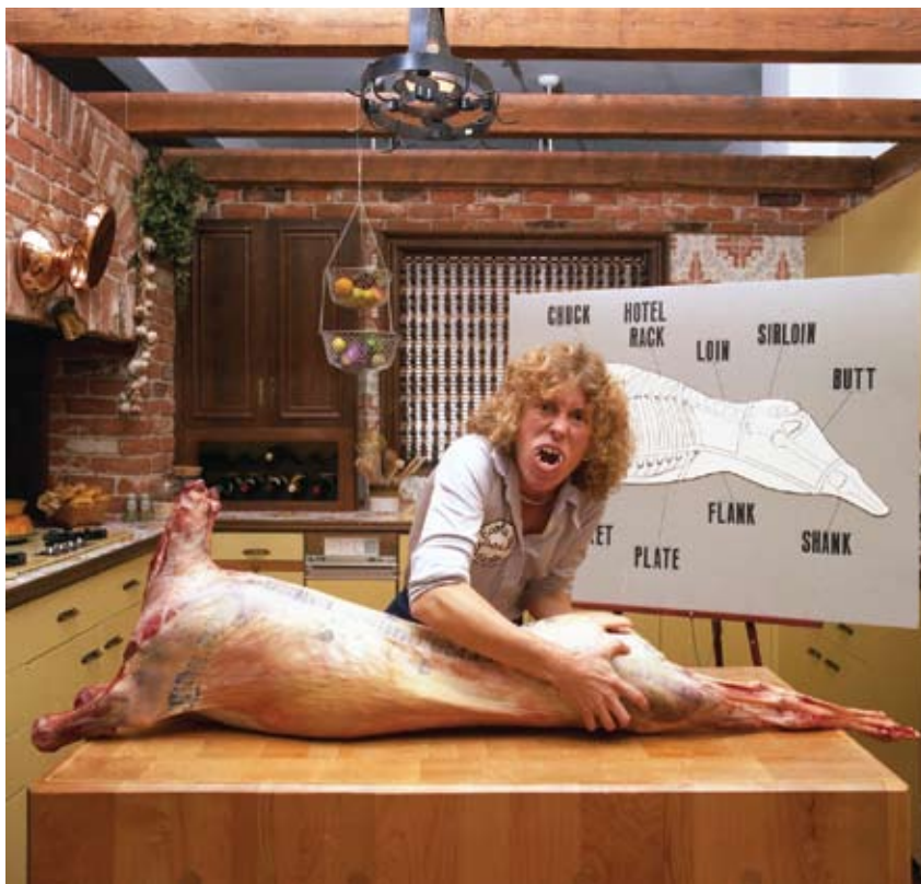
Suzanne Lacy Learn Where the Meat Comes From , 1975

FOOD can be viewed as a tangible manifestation of the conversations generated by second-wave feminists who were reacting to the fact that domestic labor performed by women was often taken for granted and received little if any direct economic compensation within the art world. They made that labor visible in their artistic practices to foreground its importance within the greater economy in which the exchange of services and goods took place. Feminist artist Suzanne Lacy's video Learn Where the Meat Comes From (1975) takes the guise of a cooking show hosted by Lacy herself. Over the course of demonstrating how to cut and section a lamb carcass, Lacy's monologue metamorphoses into a cannibalistic performance in which she compares sections of her own body to that of the animal, and then sprouts a set of beastly fangs with which to devour the slab of meat in front of her. Like a modern day Grimm's Fairy Tale, the video draws parallels between carnivorous desire, consumptive greed, physical violence and sexual assault. Glenn Lewis