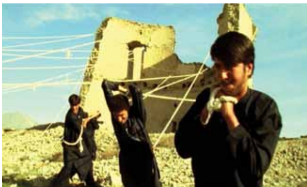
Lida Abdul What we saw upon awakening , 2006

Lida Abdul's videos explore the relationship between architecture, memory and identity in Afghanistan—a country which has, throughout the last several decades, continuously been stricken by conflicts, invasions, migrations and displacements, and has witnessed systematic destruction. Demolished landscapes and public and private properties serve as a stage for performing simple, but visually and metaphorically striking actions. What we saw upon awakening is video footage of men who, by pulling the ropes wrapped around architectural elements, are trying to pull down the ruined unidentified