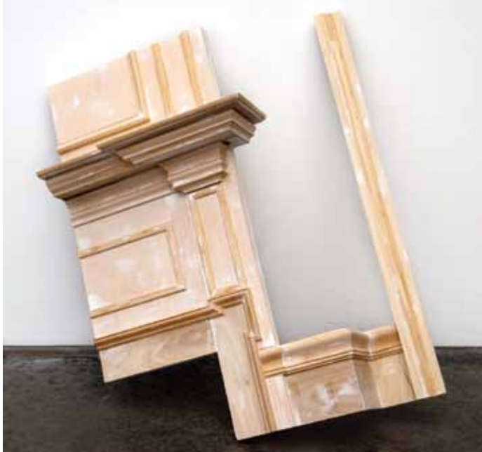
Jonggeon Lee Where It Stops , 2008

such as staircases or hardwood floors, that have been removed from their original surroundings. These structures evoke both the time and space of their origins but in a different context; the artist distorts and crops them, reconfigures their scale and material, removes their initial function, and combines them with contemporary, everyday objects. Lee's preoccupations stem from his personal story of cultural dislocation, living in-between places, and a disrupted sense of belonging. The architecture thus becomes the metaphor for individual and social memories, their fragmentation and metamorphosis.