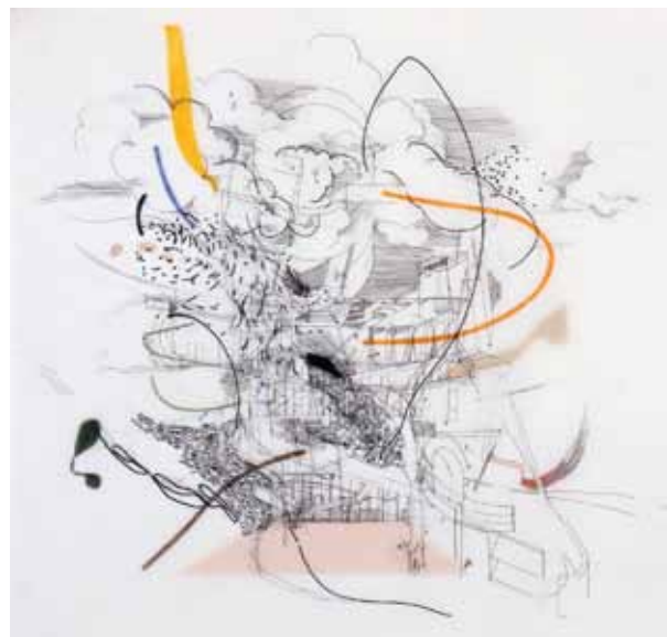
Julie Mehretu Untitled , 2000

Jonggeon Lee's sculptures and installations also delve on spaces as constantly changing and unstable entities. The artist focuses on both domestic and public architectural elements,