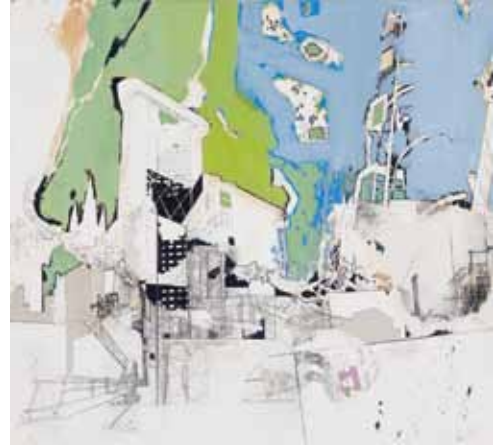
Peter Owen Untitled, 2010

Abelardo Morell's Camera Obscura series of photographs, featuring different places around the world, addresses passage of time, continuous changes and coexistence of old and new in our urban surroundings. For making his captivating works, the artist employs an elaborate process; he uses well-known camera obscura phenomenon of projecting an image on a wall.