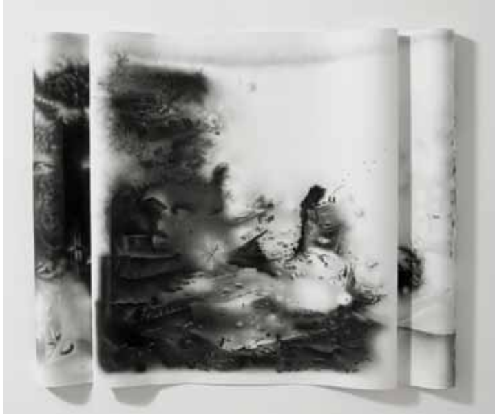
Charlotte Schulz The uneven intensities of duration: suspended in the midst of an encounter with a flood, the unknown past carries itself into a current location and pressures a rescue from geographical forces, 2010

of the material found around the exhibition space and the surrounding streets of Long Island City—a neighborhood that is going through dramatic architectural, cultural and social transformations. Although altered and rearranged through the artist's interventions, the inherent nature of found materials still define the structure, forms and final appearance of each one of his works. For Middlebrook, the art work might serve as a trigger to evoke history and social and cultural importance of materials and particular sites, as well as to playfully comment on complex and often tense relationships between natural and built environment, raising questions about consumption and enhancement.