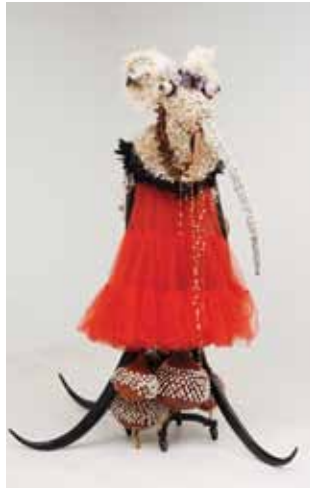
Rina Banerjee She was now in western style dress covered in part of Empires' ruffle and red dress, had a foreign and peculiar race, a Ganesha who had lost her head, was thrown across sea until herself shipwrecked. A native of Bangladesh lost foot to root in Bidesh, followed her mother full stop on forehead, trapped tongue of horn and grew ram-like under stress , 2012

By "Beyond Culture" in our title, we focus as well on the in-between. Soo Sunny Park's Painted Space: Long Dress , 2002, is a hybrid work—a sculpture/dress made of painting materials—