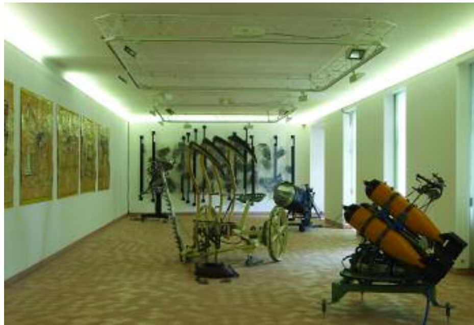
TODT Installation View , 2007

Ezra Pound wrote, "Artists are the antennae of the race." They are always the first to respond and reflect