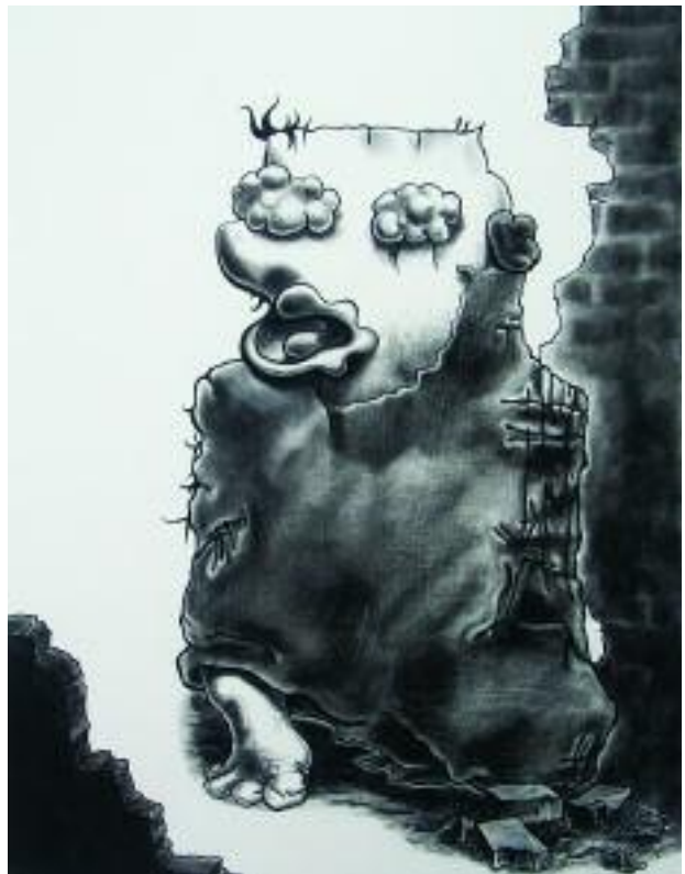
D. Dominick Lombardi Boy with Clubbed Foot (Potato Eyes) , 2006