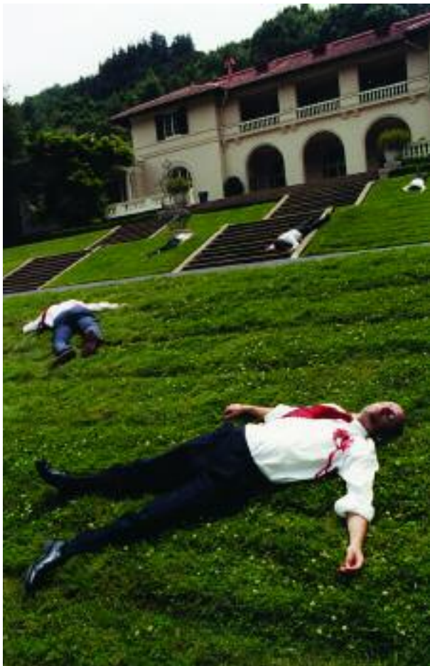
Laura Parnes The Only Ones Left , 2007

These notions of the end times abound at turning points in history when there is turmoil and seismic change. The book of Revelation , the last canonical book of the New Testament outlining events culminating in