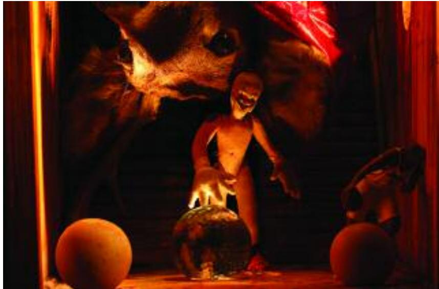
Michael Zansky Order of Magnitude , 2008

D. Dominick Lombardi's sculptures, drawings and tattoos all tell a post-apocalyptic tale with an elaborate cast of characters who have survived a globe-shaking environmental disaster. These denizens of the future have evolved in reaction to a poisonous world where the average life expectancy is 20 years. Some of these creatures such as Boy With Clubbed Foot (Potato Eyes) and Whistling Bird are also the result of genetic engineering where food and animal DNA have